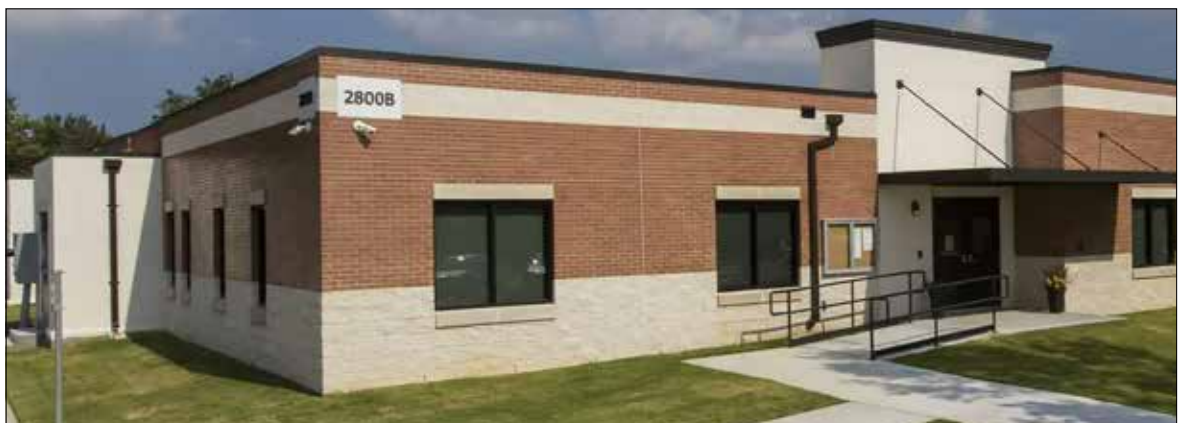
Design-build construction firm Ramtech Building Systems of Mansfield, TX has announced that the company has received a first place Awards of Distinction trophy at the 41st annual Modular Building Institute 2024 World of Modular Conference and Tradeshow. Over 1,500 attendees gathered at the sold-out conference for networking opportunities and to hear speakers and presenters from across the world.