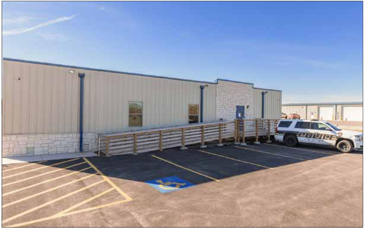
City of Clyde, TX Police Department pictured above.