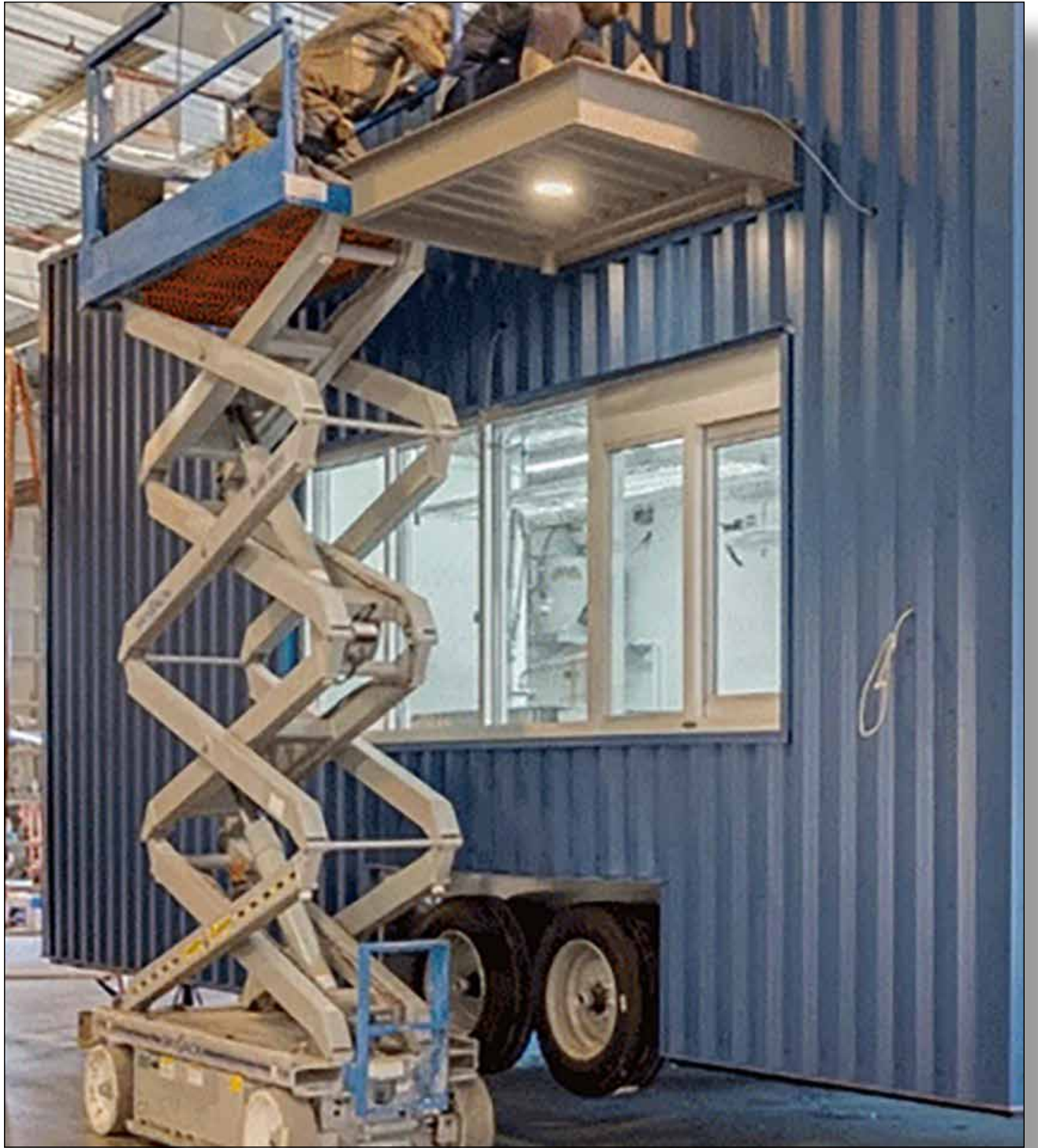
Russo Modular delivers their 8th Dutch Bros coffee modular building to Klamath Falls, OR.