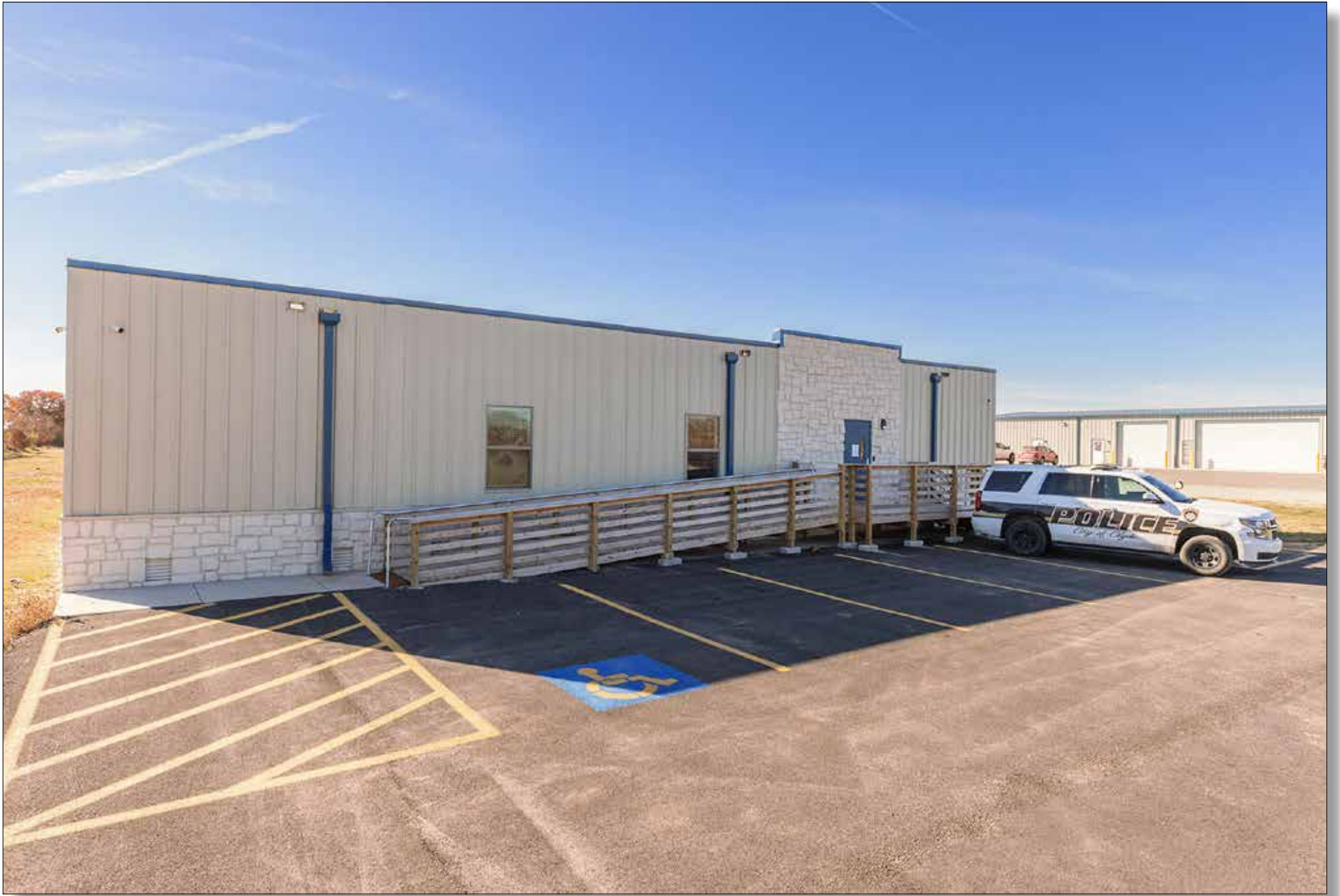
City of Clyde, TX Police Department pictured above.