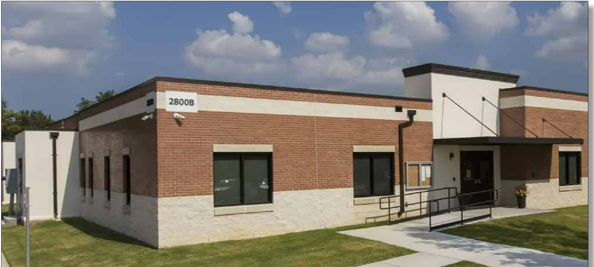
Design-build construction firm Ramtech Building Systems of Mansfield, TX has announced that the company has received a first place Awards of Distinction trophy at the 41st annual Modular Building Institute 2024 World of Modular Conference and Tradeshow. Over 1,500 attendees gathered at the sold-out conference for networking opportunities and to hear speakers and presenters from across the world.