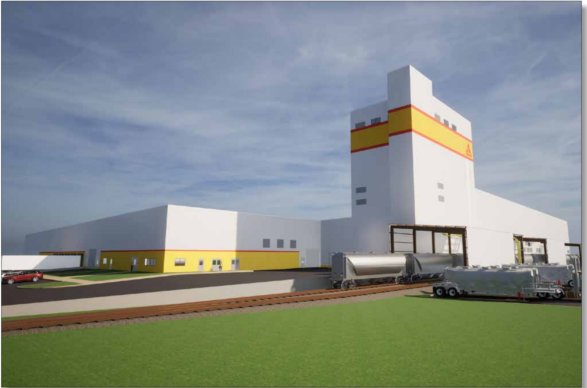
Sika, the world leader in the development and production of systems and products for bonding, sealing, damping, reinforcing, and protection in the building sector and automotive industry, has broken ground for a new state-of-the-art 250,000 sq. ft. mortar production plant, expected to be in operation in late 2025.