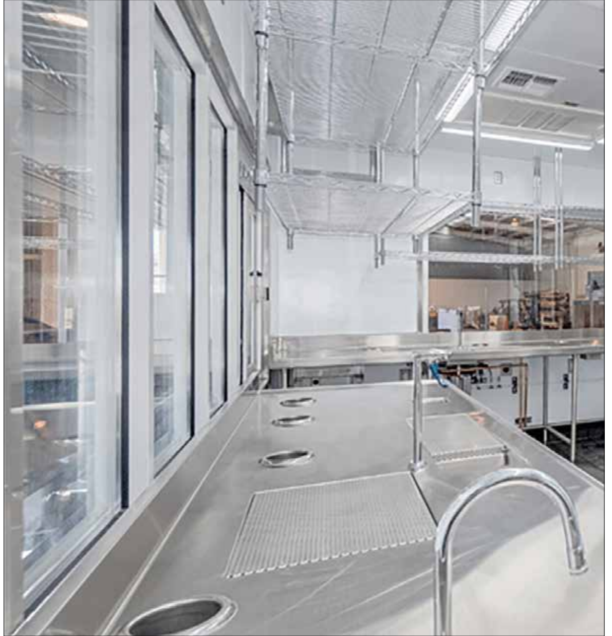
Russo Modular delivers their 8th Dutch Bros coffee modular building to Klamath Falls, OR.