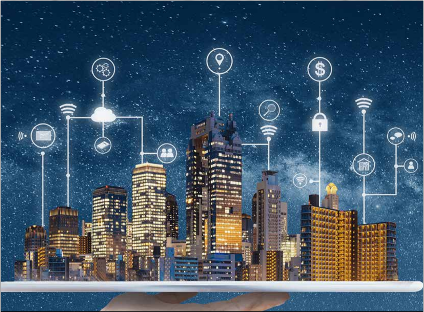
Viewpoint, the acclaimed documentary series hosted by actor Dennis Quaid, is announcing a unique partnership with Integrated Projects, a built intelligence company, to develop a new episode delving into “The Future of Real Estate.”