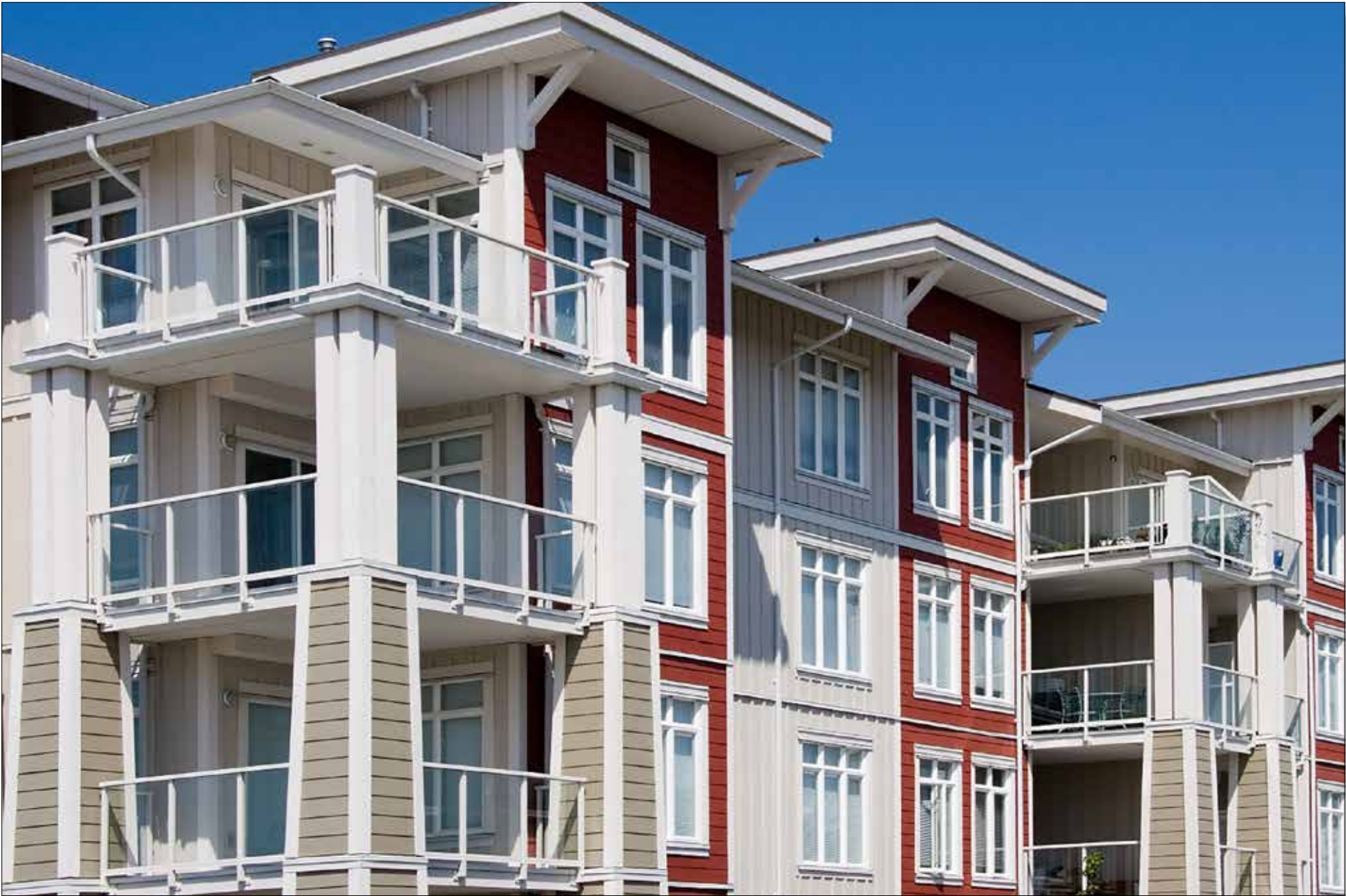
Churchill Stateside Group is Pleased to Announce The Closing of Starway Village I and Starway Village II, Set to Provide 278 Affordable Housing Units, Totaling $37.1 Million in Loans through Churchill Stateside Group, in Wilmington, North Carolina.

CLEARWATER, Fla., Feb. 29, 2024 PRNewswire-PRWeb