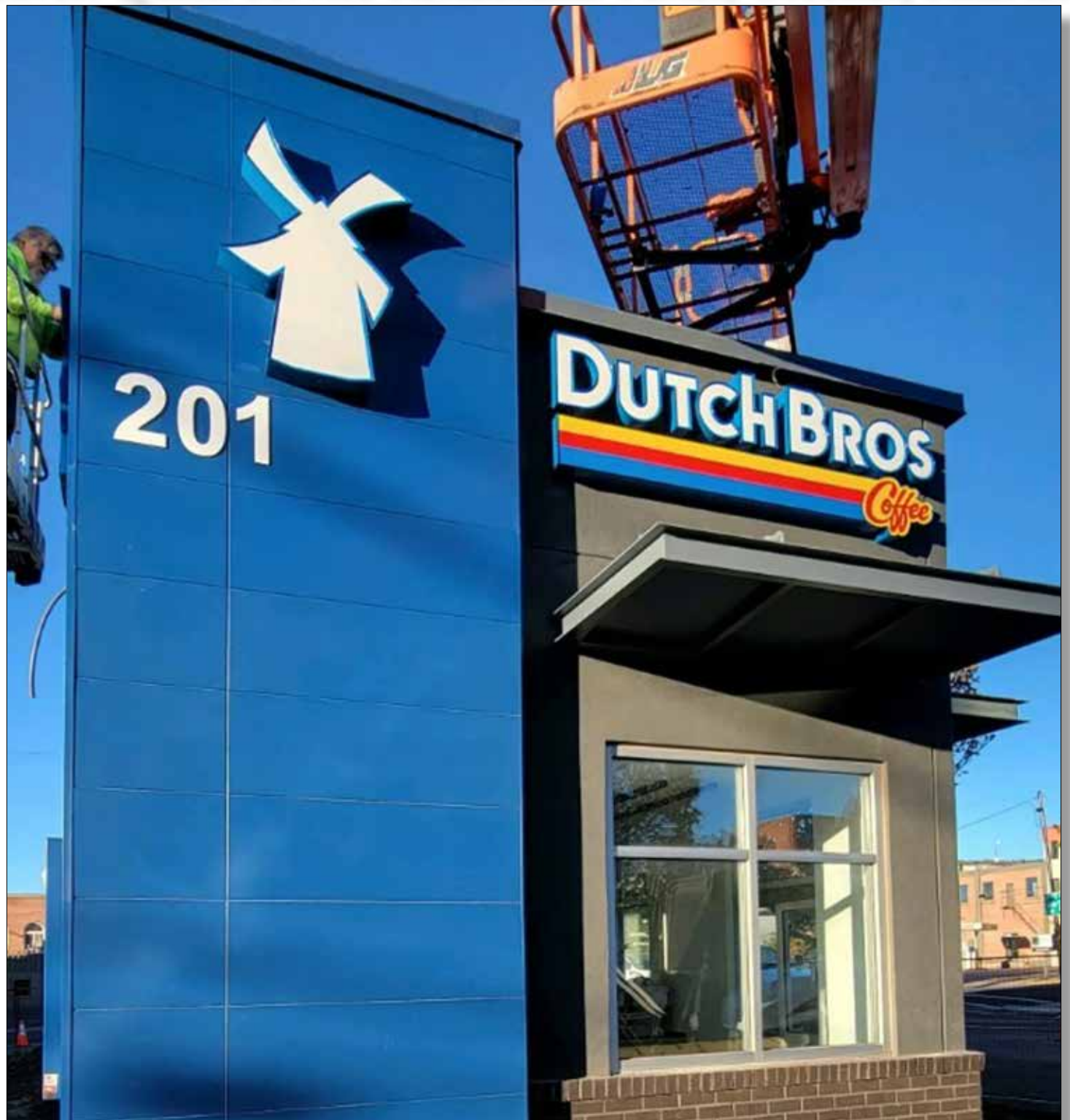
Russo Modular delivers their 8th Dutch Bros coffee modular building to Klamath Falls, OR.