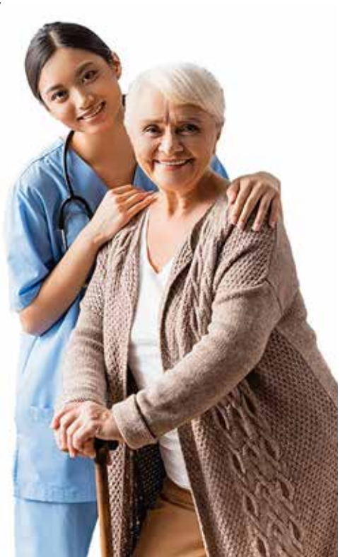
New Senior Housing Management Contract Underscores Tutura's Track Record of Success; Tutura's newly managed communities are located in Kansas, Iowa and Nebraska